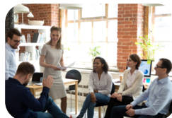
A Guide to Managing Stress and Enhancing Wellness