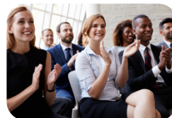
Inclusion and Equality Guide and Tools