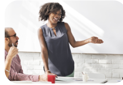
Recruitment Guide and Tools