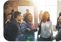
Orientation and Onboarding Guide and Tools