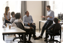
Effective Communication and Meeting Guide and Tools