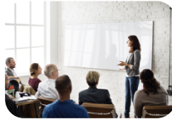
A Guide to Enable and Empower Your Employees