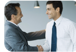
Goal-Setting and Action-Planning Guide and Tools