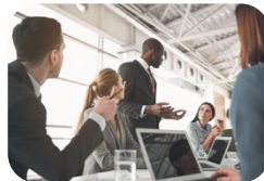
Employee Engagement Guide and Tools