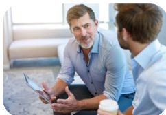
A Guide to Building an Ethical Business