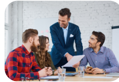
Coaching Conversation Guide and Tools