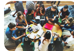
Emotional Intelligence and Leadership Training