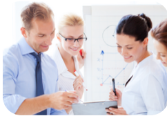
A Guide and Tools to Master Facilitation and Training