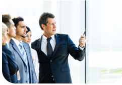
A Guide to Defining and Implementing Your Mission and Values