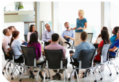
Change Leadership Guide