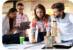
A Guide to Building a Culture of Creativity and Innovation