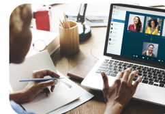
A Guide for Leading a Remote Workforce